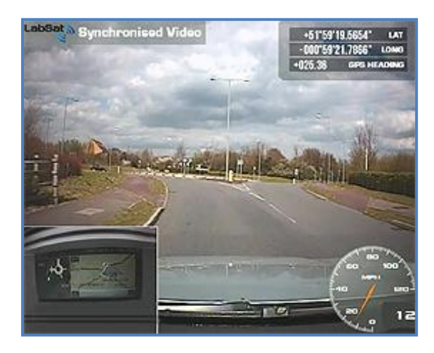
Video VBOX replay of an onboard navigation screen

The turntable system uses GPS and GLONASS satellite constellation data to record live drive data combined with vehicle yaw rate and wheel speed information.